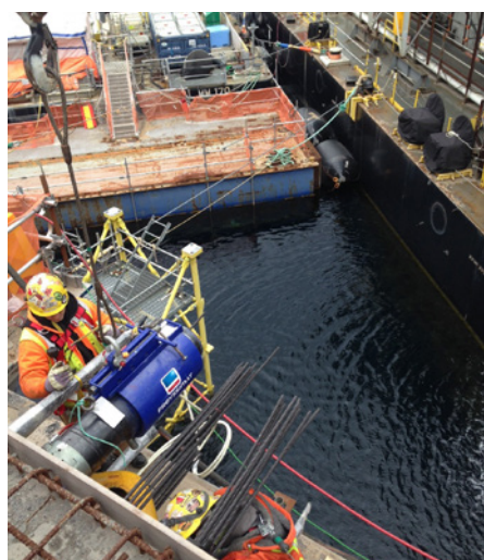
Stressing operation on offshore concrete structure