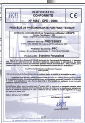
ETAG 013 - "European Technical Approval" and the associated "CE Declaration of Conformity"