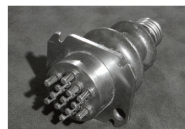
Freyssinet C-system anchorage

Such engineering contractor culture makes Freyssinet the ideal partner for specialized construction projects in the respect of the highest quality and safety requirements. The Freyssinet expertise goes hand-in-hand with the professionalism of its teams, located all over the world and trained within the Freyssinet PT Academy.